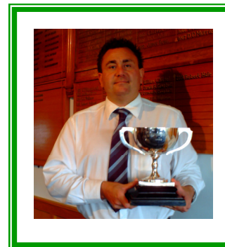
The Gents Club Champion