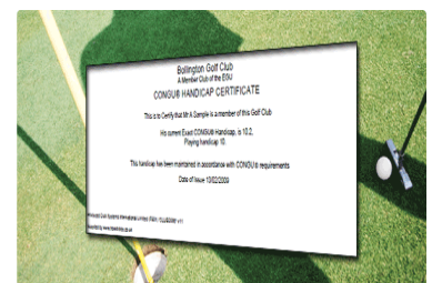
HowDidiDo Handicap Certificate

You can now print your own handicap certificate via HowDidiDo. Just access HowDidiDo and go to My Golf, then My Handicap Certificate and Click here to view and print your personal handicap certificate.