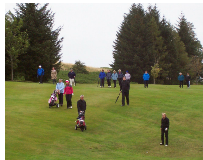
Ladies Championship on 14th