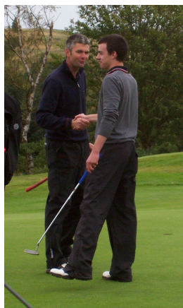
Men's finalists on the 36 th hole, at the end of the Championship