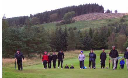
Left: Gallery approaching 15 th on Allander Right: Nearing 16 th Green.

Next year it would be good to see bigger crowds turn out to watch competitors play for the Championships and other Knockout Trophies.