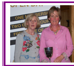
The Ladies Club Champion receives Trophy from the Captain