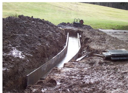
Work underway on right side