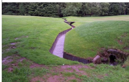
The completed ditch, 13 th hole on the Hilton