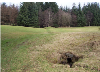
Right side before work started.